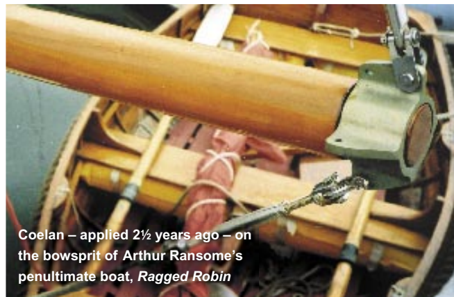
Coelan – applied 2½ years ago – on the bowsprit of Arthur Ransome's penultimate boat, Ragged Robin

Next month we review the high-hazard Med test and discuss the 'pros and cons'