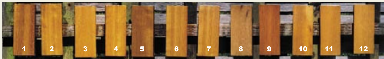
Start of test