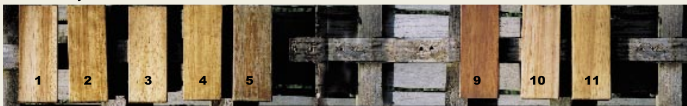
Two and a half years into test